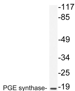
Western blot analysis of lysate from A549 cells using Anti-PGE synthase Antibody.